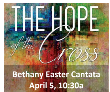
Illustration by Yana Kravchuk on Unsplash